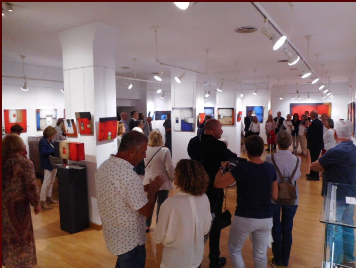
Some openings and cultural activities of the gallery